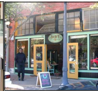
Bishop Arts District